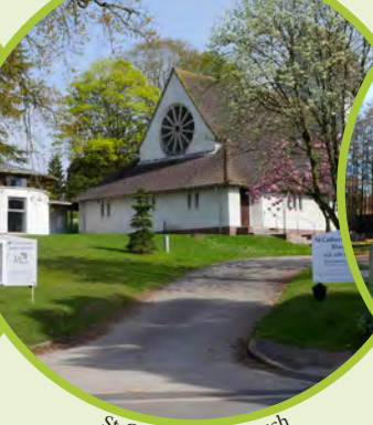
St Catherine's Church