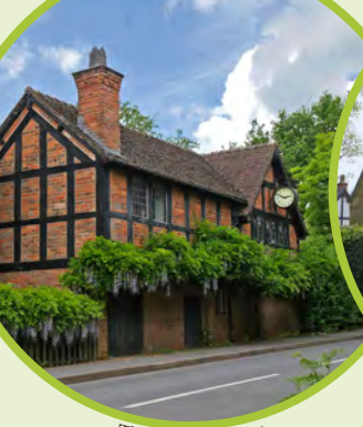
The Clock House