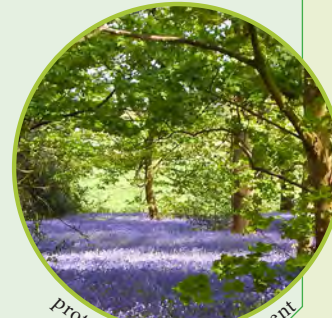
protecting our environment

(Through Policies NE1 Geodiversity, NE3 Protecting and Enhancing Local Biodiversity and CF3 Local Green Spaces)