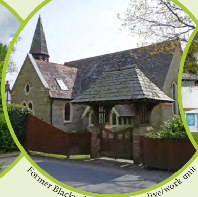
Former Blackwell Church - now live/work unit