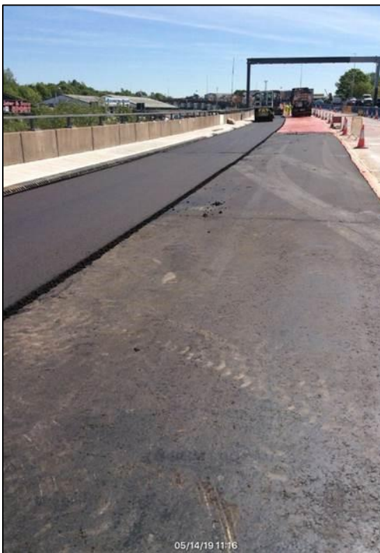
Surfacing to hard shoulder and lane 1

We recovered 24 vehicles from our free recovery areas this week.